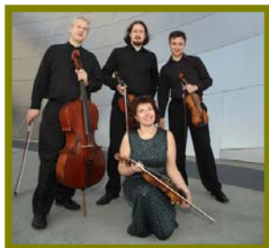
St. Petersburg String Quartet